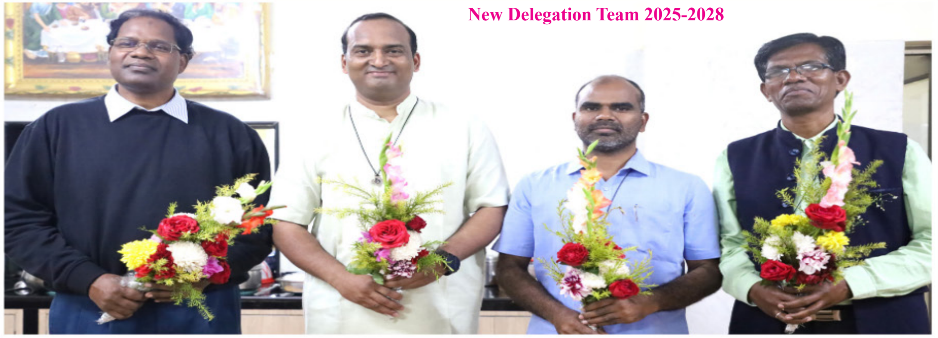
New Delegation Team 2025-2028